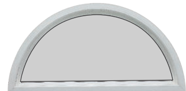
Architectural Half Circle