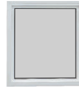
Casement Picture Window